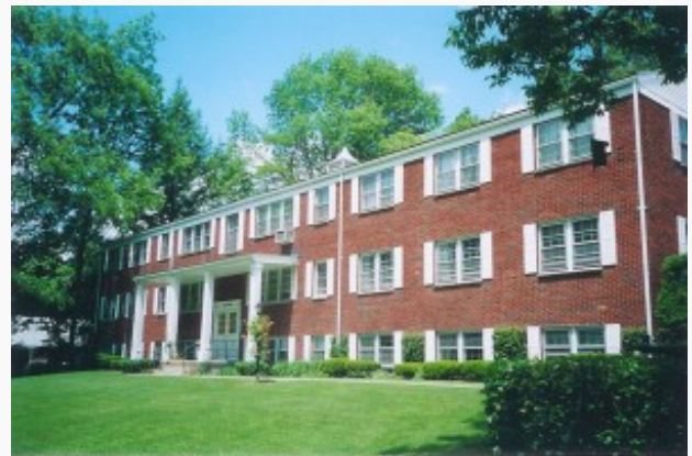
McGeordan Apartments, 251 N. Main Street – Wellsville, NY

Wellsville, NY Brian Heine arranged the sale of the McGeordan Apartments at 251 N. Main St. for $1.65 million. The McGeordan is a 36-unit brick apartment complex in three 12-unit buildings with large apartments including 18 two-bedroom, 15 three-bedroom, and 3 one-bedroom. The three-bedroom apartments have multiple bathrooms. The apartments with all utilities included in the rent attract quality residents producing a very stable tenancy, rent collections in 2014 totaled 97.5% of the rent roll. Wellsville is the largest township in Allegany County and is the retail and entertainment center for the southern half of the county. The seller, Yuma Holdings Corp., completed a reverse Section 1031 tax deferred exchange on closing. The reverse 1031 exchange imposes a 180 day deadline, including the time for both the marketing and closing, on the seller and commences when the seller closes on the replacement property. The buyer, a Rochester real estate investor, paid an 8.9% cap rate. Heine is a licensed real estate broker in New York State.